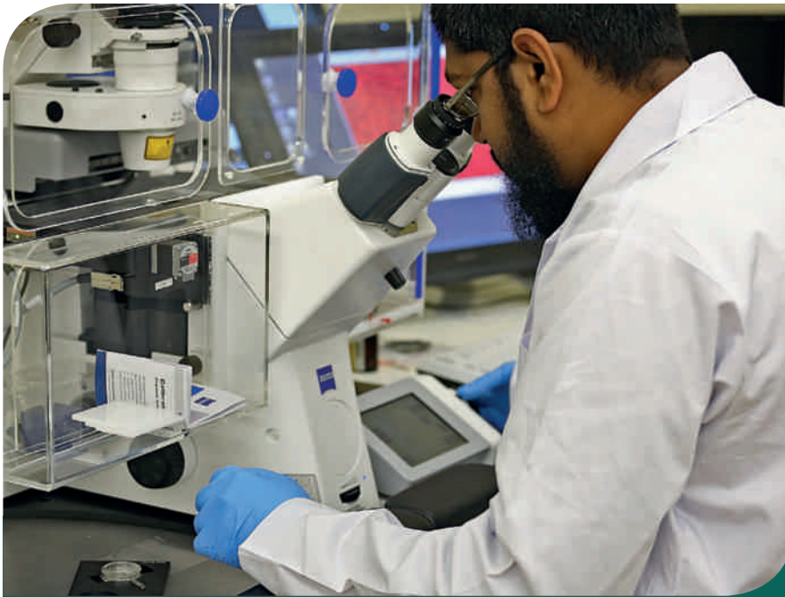
KAIMRC's solid infrastructure is unparalleled in the region