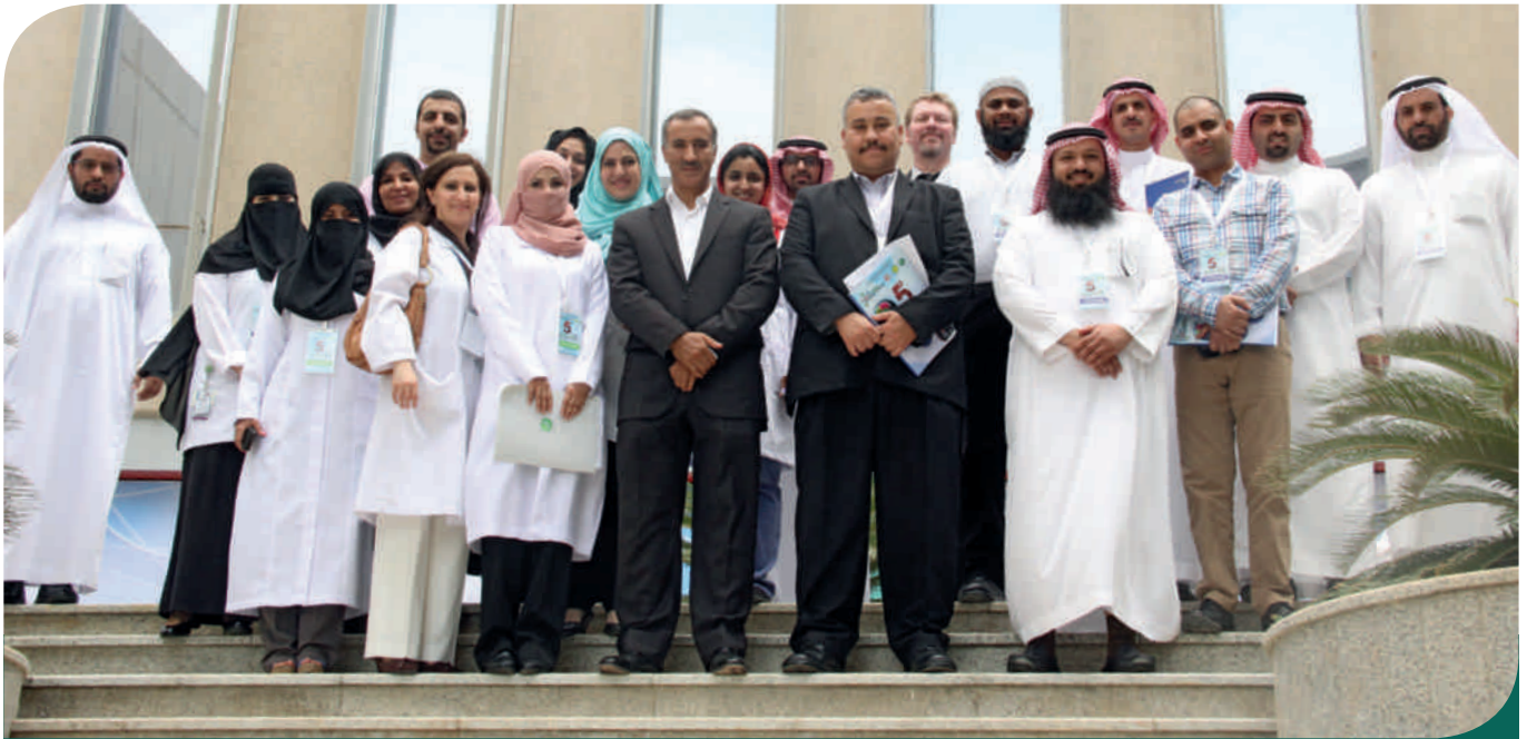
KAIMRC is dedicated to the intellectual growth and development of its researchers

K AIMRC's goal of becoming a world leader in translational medical research can only be achieved with a talented and dedicated workforce. Its leaders set out to build a community of world-class biomedical scientists and are fully committed to providing them with an environment conducive for productive research with all the training and assistance they need.