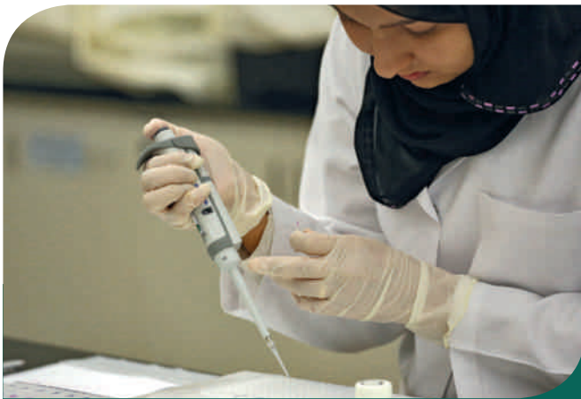
The infectious diseases laboratory tackles community threatening diseases

An infectious diseases laboratory set up to research concerns specific to Saudi Arabia and the Middle East will be a valuable resource and a timely addition to healthcare in the region.