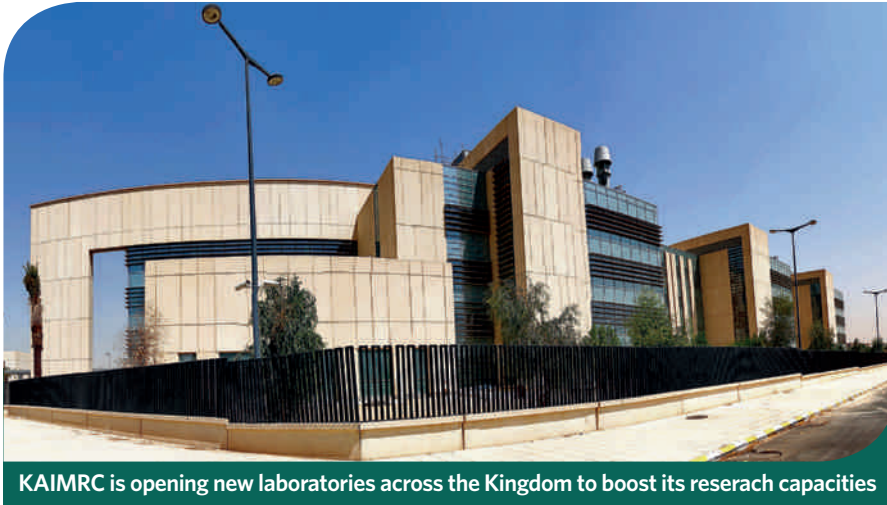
KAIMRC is opening new laboratories across the Kingdom to boost its research capacities